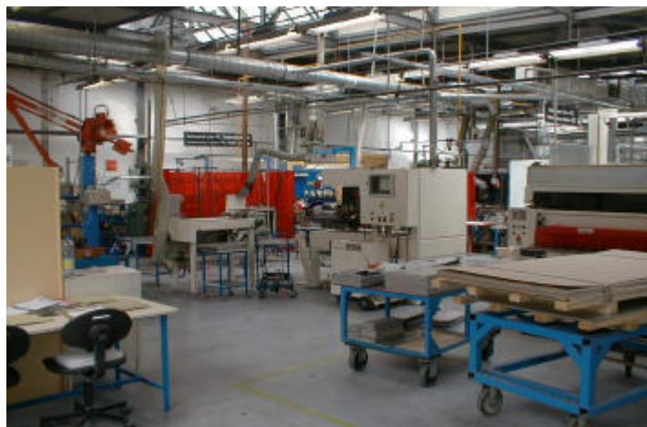
Stainless steel production

The present SAFT – FERAK is aware of the fact that not only a perfect process or product can fully satisfy a customer. Projects, aiming to decrease the delivery time by weeks, try to improve customer services to increase the ability of competition.