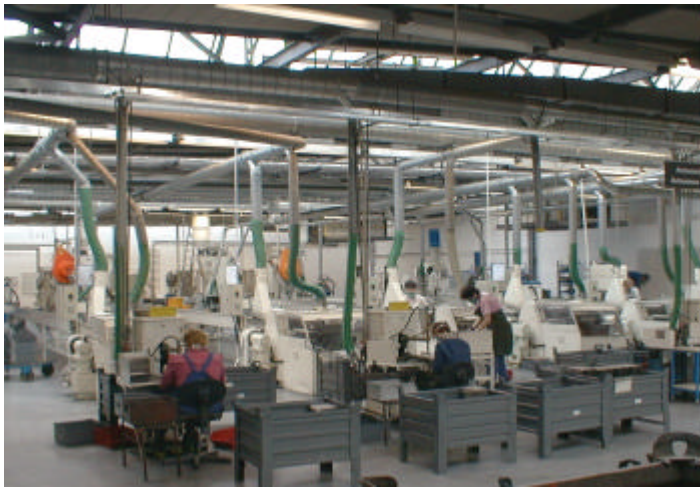
Plate production SAFT-FERAK a.s.

Even the name of the process is saying that there is an afford of becoming a world producer who will set the direction in its field of activity not only in quality and by innovation of its own products but by the respect to the environment as well.